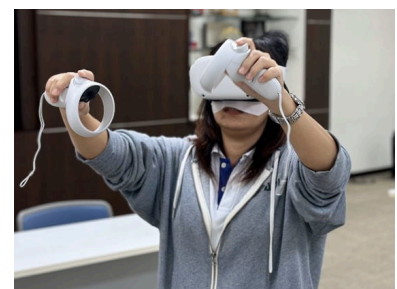
VR simulator experience (loaned unit) at Fuji Oil (Thailand) Co., Ltd.