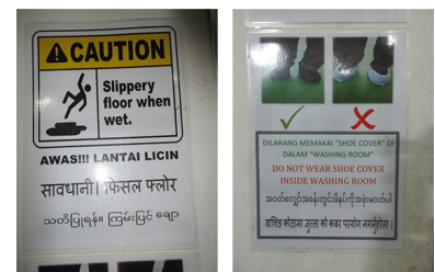
Example of a sign at Fuji Global Chocolate (M) Sdn. Bhd. (Malaysia)

At Group companies outside Japan, we display safety-related reminders in multiple languages so that employees who use different languages can also carry out their work safely.