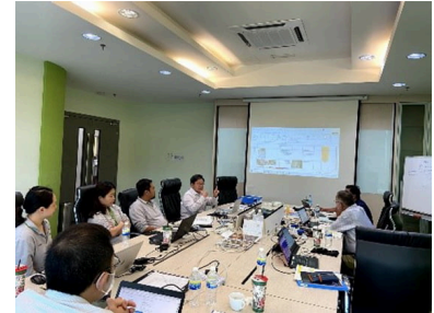
Audit conducted at Fuji Global Chocolate (M) Sdn. Bhd. (Malaysia)

Planned audits are conducted each year at Group companies in and outside Japan. In FY2024, eight production sites in Japan were audited by the Safety, Quality, and Environment Audit Team of the Safety, Quality, and Environment Audit Office at Fuji Oil Co., Ltd., the regional headquarters in Japan. For Group companies outside Japan, the next occupational health and safety audits are planned based on the results of their previous audits. In FY2024, the Production Productivity Management Group conducted audits of eight production sites. At production sites where audits have been conducted, progress checks and follow-up checks are carried out after improvements have been made in response to the issues identified. We aim to eliminate work-related accidents at our sites through this ongoing cycle of audits, improvements, and follow-up.