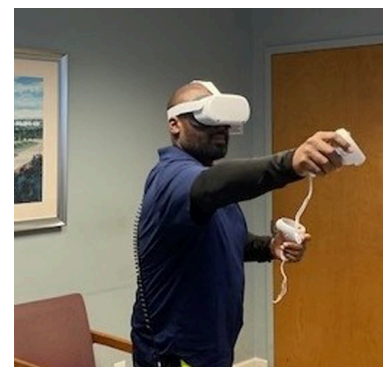
VR simulator at Fuji Vegetable Oil, (USA)

*2 Meetings held before the day's work begins to inform workers about safety matters that require special attention that day.