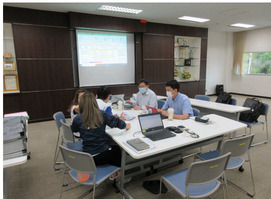
Auditing at Fuji Oil (Thailand) Co., Ltd.

* Risk Management > Significant Group-wide Risks https://www.fujioilholdings.com/en/sustainability/risk/