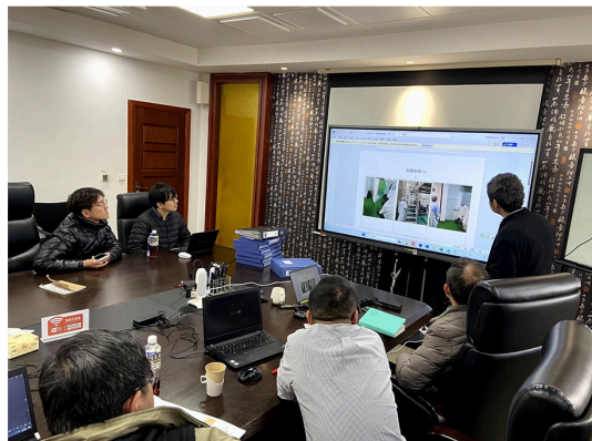
Auditing at Blommer Chocolate Manufacturing (Shanghai) Company Ltd. (China)