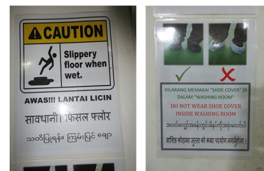
Example of a sign at Fuji Global Chocolate (M) Sdn. Bhd. (Malaysia)

At Group companies outside Japan, we display safety-related reminders in multiple languages so that employees who use different languages can also carry out their work safely.