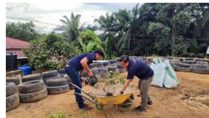
Wild Asia supporting the establishment of medicinal plants at a BIO farm as part of intercropping.