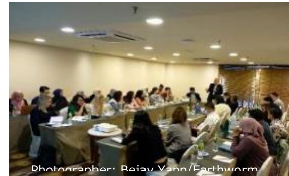
Stakeholder meeting with MPOB on Sawit Intelligent Management System (SIMS)