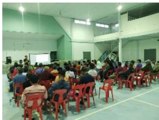
Wild Asia conducting introduction session to dealers and their suppliers.