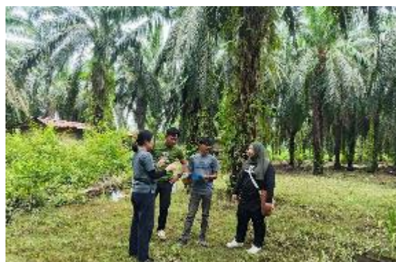
Wild Asia conducting baseline monitoring at BIO farms.