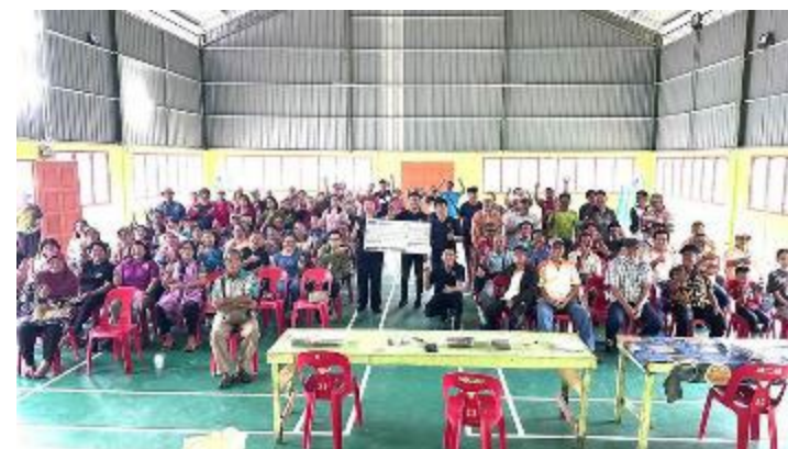
Wild Asia distributing RSP0 premium to RSP0 certified farmers.