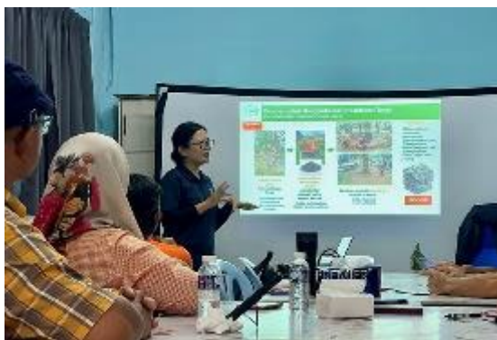
Wild Asia conducting Biochar training to farmers.