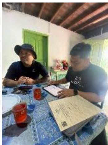
Piloting farmer onboarding through the WAGS App to support digital registration, field monitoring, and certification readiness.