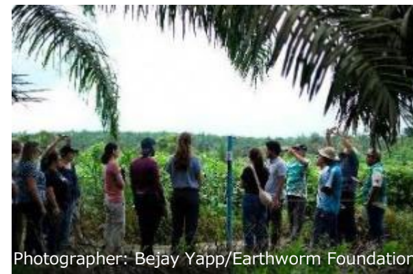
Early warning system for HEC management by Sungai Ara Farmers' Cooperative (KPSA)